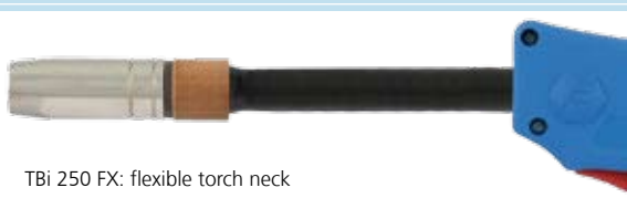
TBI 250 FX: flexible torch neck