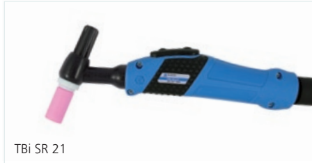
TBi SR 21

wassergekühlt / water cooled / refroidissement par eau 100% (10 min.) AC: 200 A DC: 220 A Ø 0.5-3.2 mm