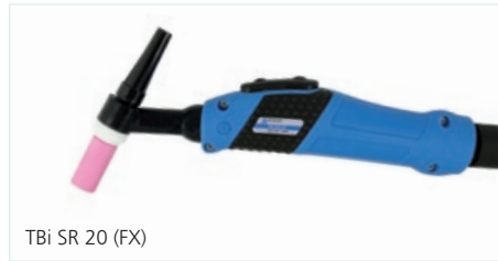
TBi SR 20 (FX)

luftgekühlt / air cooled / refroidissement par air 60% (10 min.) AC: 95 A DC: 110 A Ø 0.5-1.6 mm