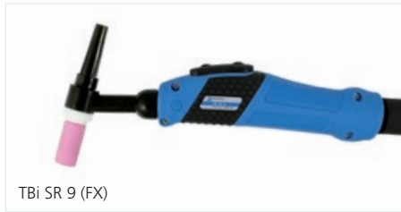
TBi SR 9 (FX)