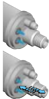
Contact tip (20)